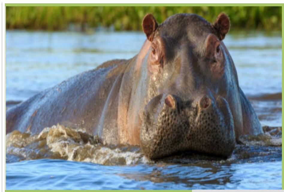
Again, if you wish to go swimming, PLEASE stay in the hotel pools!!! :>)

In case you forgot, here's another shot of Ol Tukai Lodge. This is our first stop on Safari.